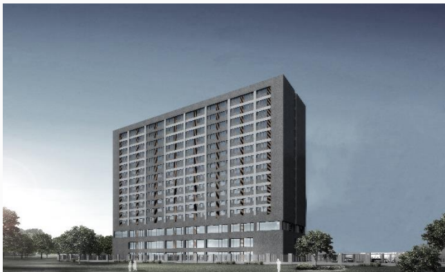
*Living Campus Rendering

Homa's new industrial setup - "No-Frost District", including Factory#8 and Factory#9, a components factory and a Living Campus, will offer an incremental annual capacity of 3 million units.